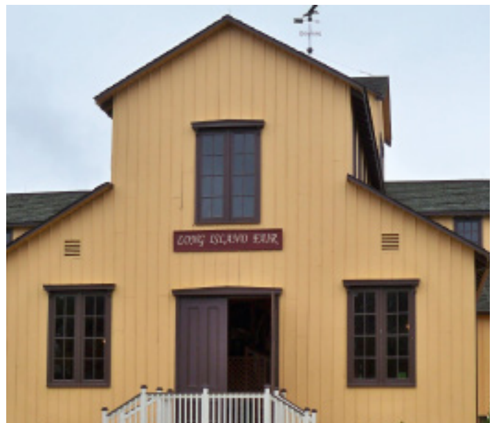
The Reconstructed Exhibition Hall